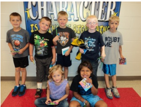
August First Grade Birthdays